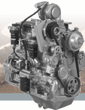
4045HF Engine shown